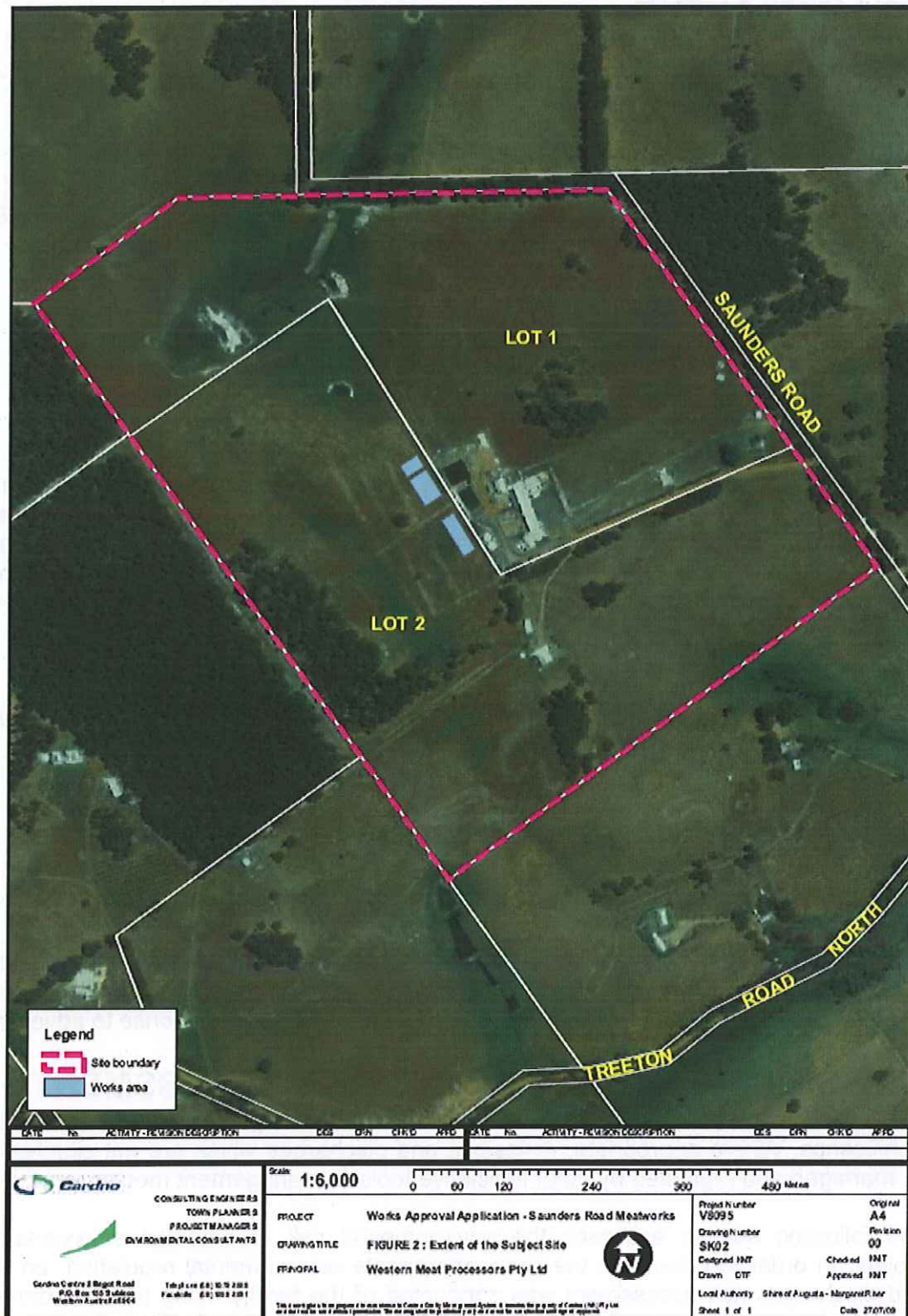
Figure 1. Cowaramup abattoir –wastewater pond system.